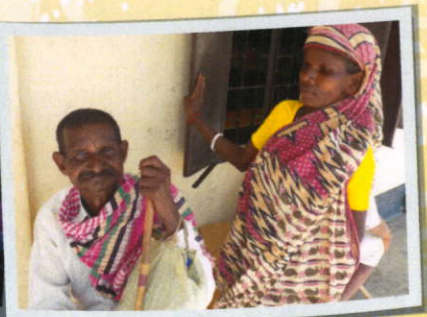
Elderly patients waiting to be seen