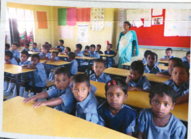
Students in classroom with new uniform