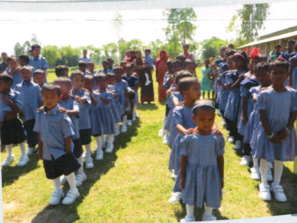
Children with new uniform