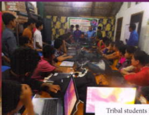
Tribal students in computer class