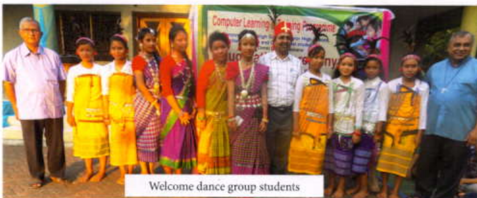
Welcome dance group students