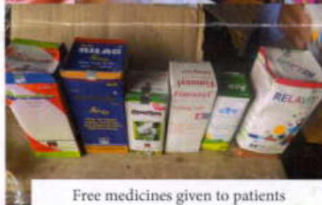
Free medicines given to patients