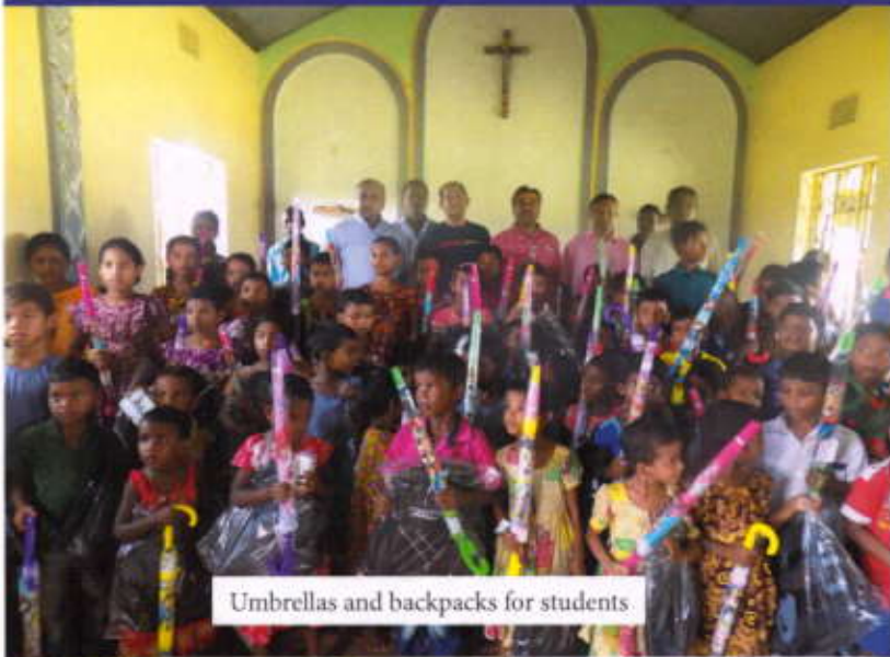
Umbrellas and backpacks for students