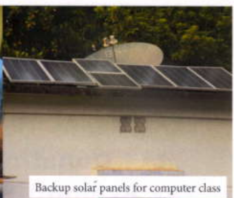
Backup solar panels for computer class