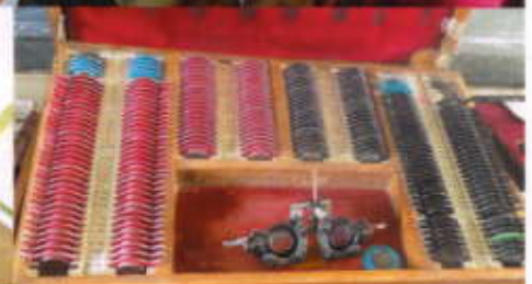
Lenses for examining patients