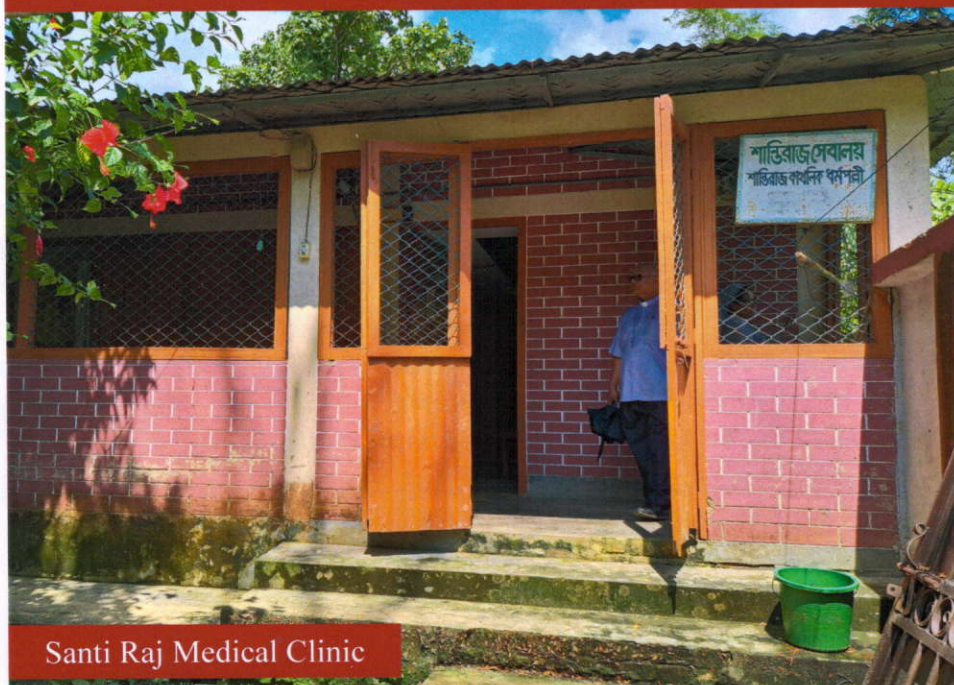
Santi Raj Medical Clinic