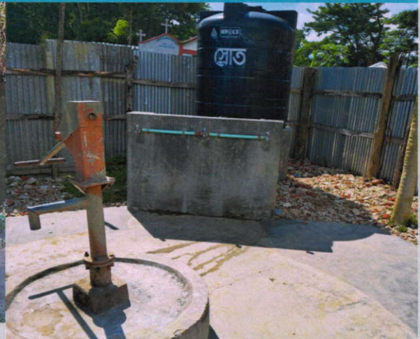
Tube well for daily use

The hostel had no running water for the girls to bathe, wash their clothes and do other daily chores. Every morning, they walked to the nearby stream before school to fetch water in pitchers and buckets. They then collected the water in a large tank inside the hostel area for their daily needs. The students would also bathe in the stream and wash their clothes when the water level was high. The poor water quality led to numerous health issues stemming from consumption of the bacteria laden