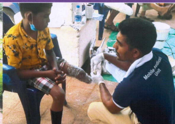
Child recipient for artificial limb