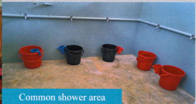
Common shower area