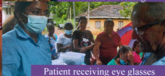
Patient receiving eye glasses