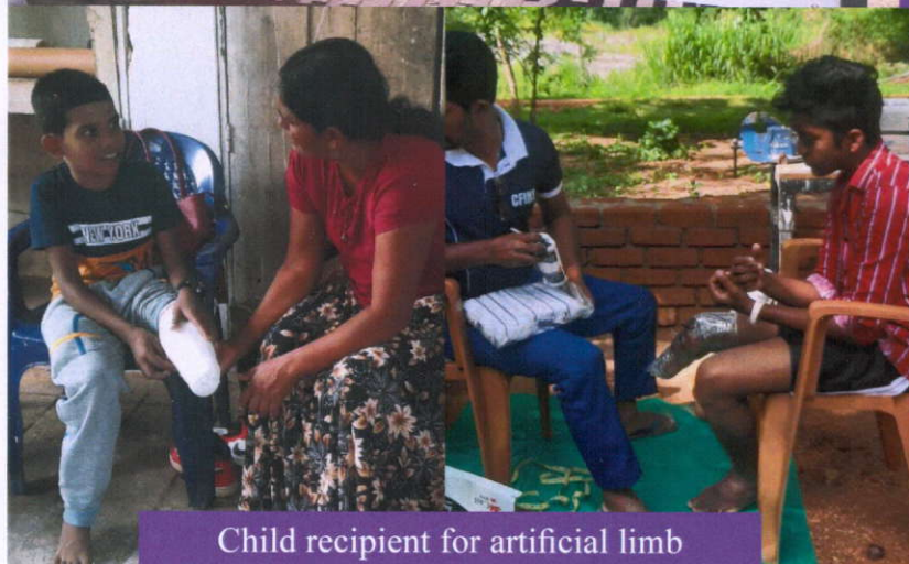
Child recipient for artificial limb