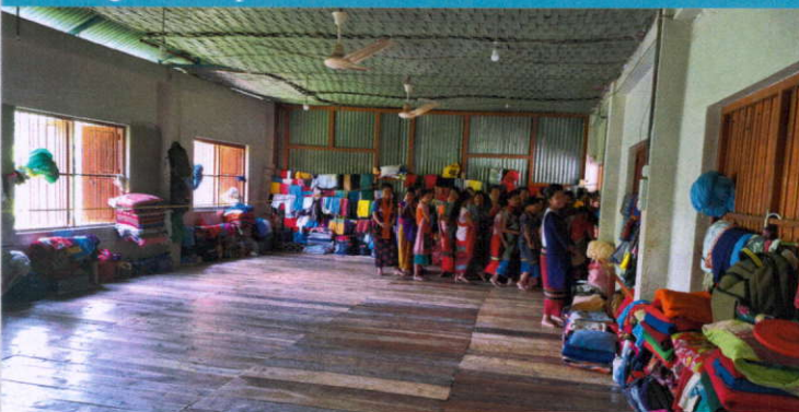
Hostel girls sleep on the floor in this common hall room

With the help of Mary Lou Kalla Foundation, the engineers dug deep holes on the hostel grounds to obtain fresh clean water. They were successful after several attempts and then ultimately installed a deep tube well. Pipes were connected so that the water could be used for drinking, for bathrooms and showers, and for washing clothes in the hostel complex.