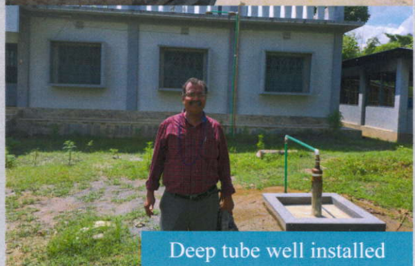
Deep tube well installed